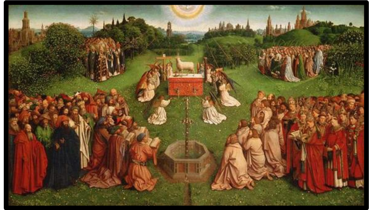
The Adoration of the Mystic Lamb from the Ghent Altarpiece by Jan and Hubert Van Eyck